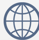
Intuitive Web UI